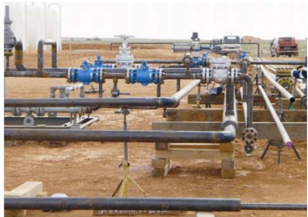
Test / production header