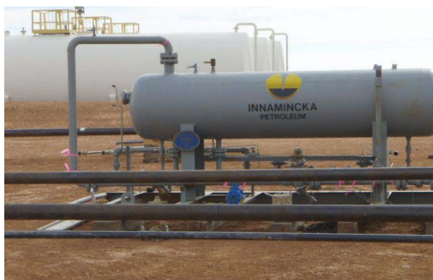
Separator at Flax Central Production Facility

The well operations will see the completion of the first production well pattern.