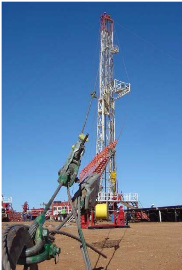
Ensign Rig 5 preparing for completion operations on Flax 5

The Ensign Rig 5 has mobilised and rigged up on the Flax 5 well as its first operation to be followed by completion operations on Flax East 1, Flax 6 and Flax 7 in due course.